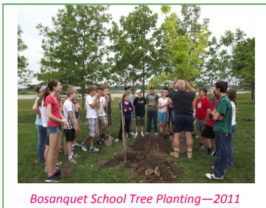
Bosanquet School Tree Planting—2011